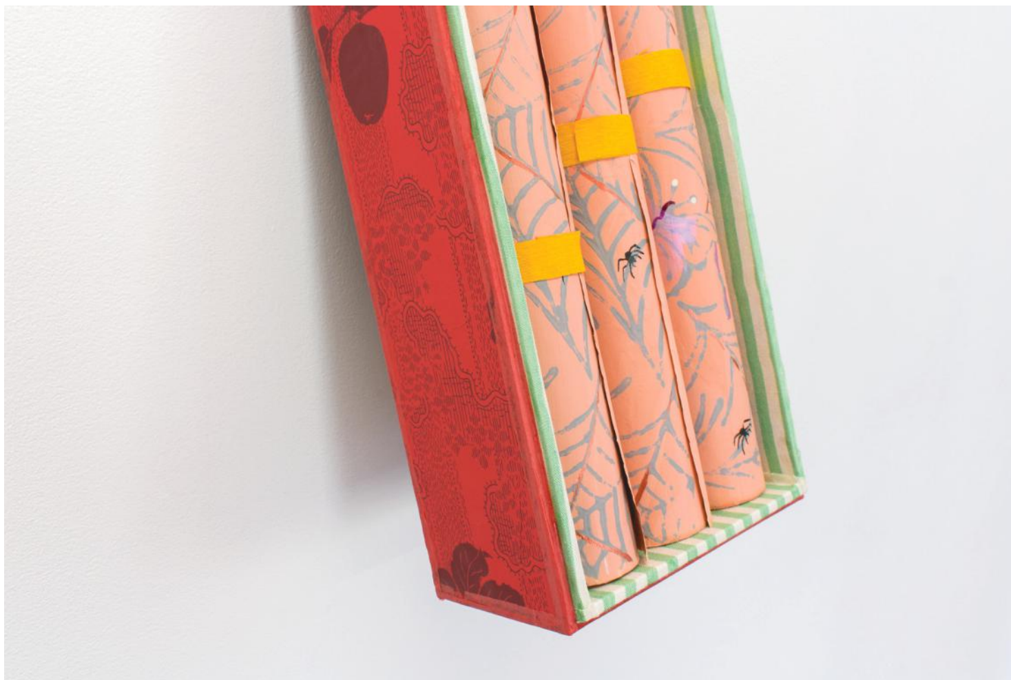
Anne Low, Paper eater , 2019 (detail)