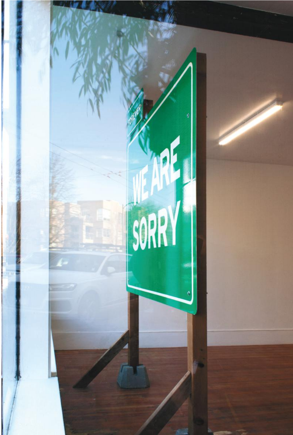
Babak Golkar, Made in Canada , 2018 (detail) aluminum, cedar, concrete, dimensions variable