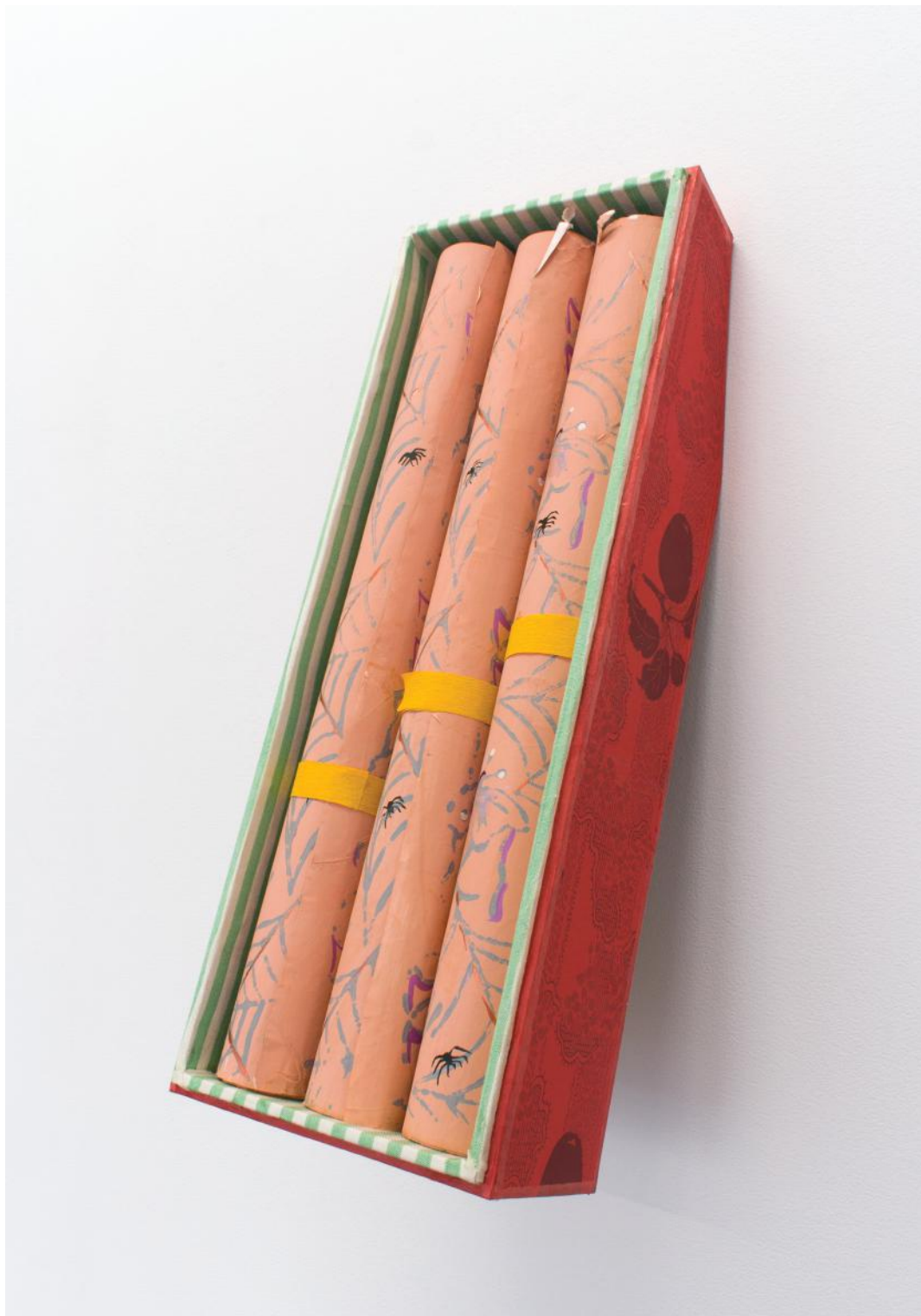
Anne Low, Paper eater , 2019