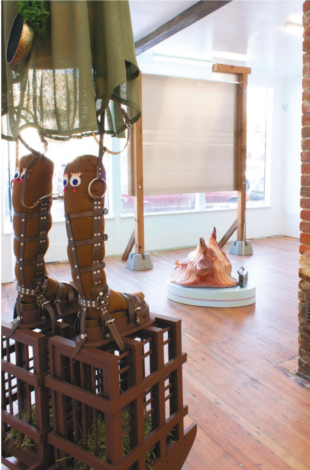
Crocodile Tears installation view