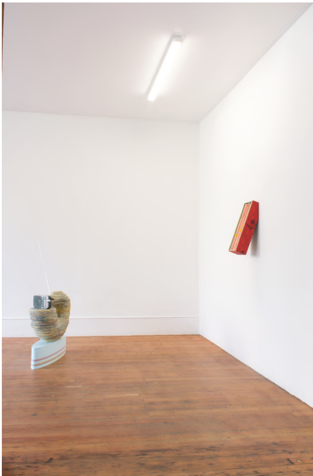
Crocodile Tears installation view