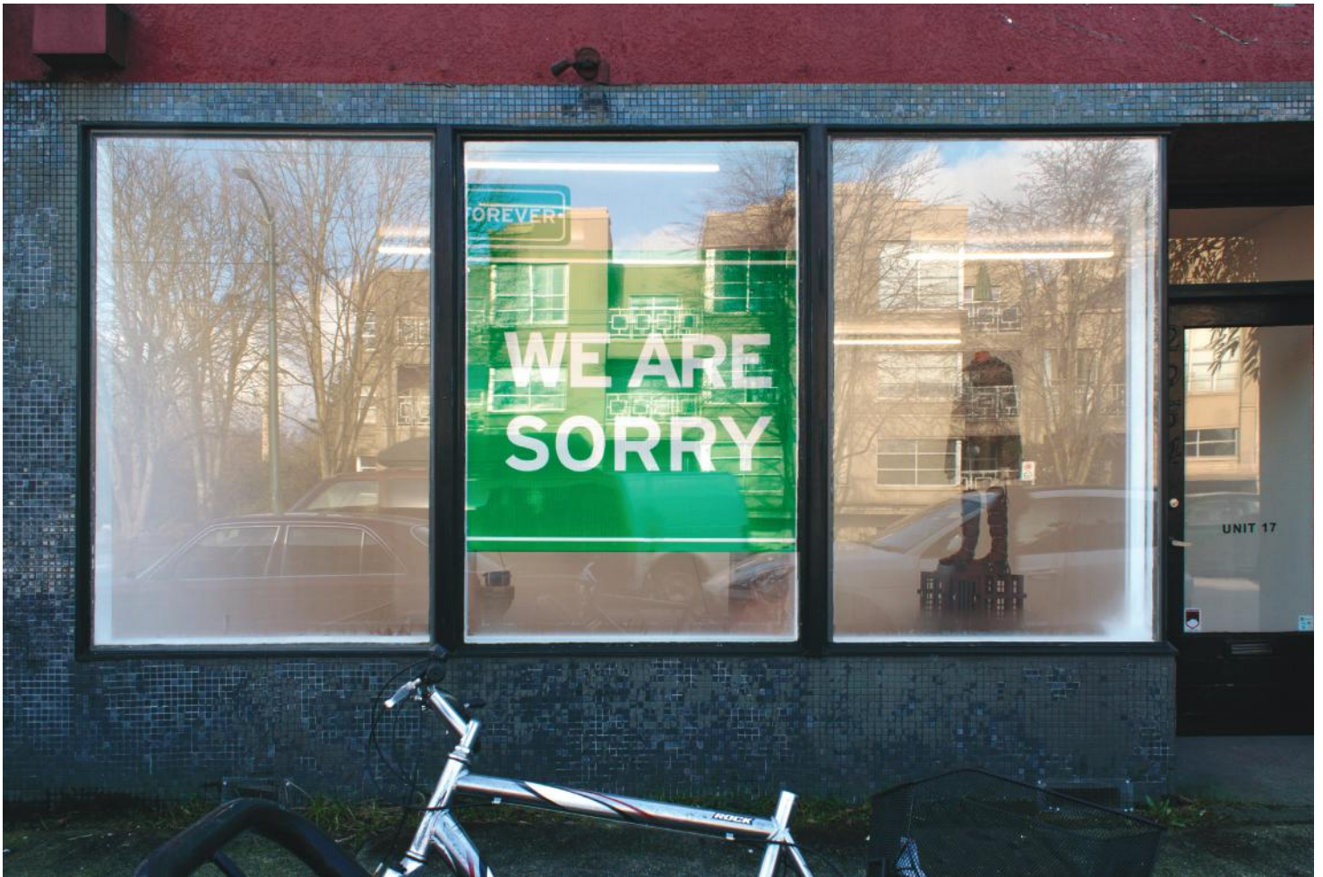
Crocodile Tears installation view with Babak Golkar, Made in Canada , 2018, aluminum, cedar, concrete, dimensions variable