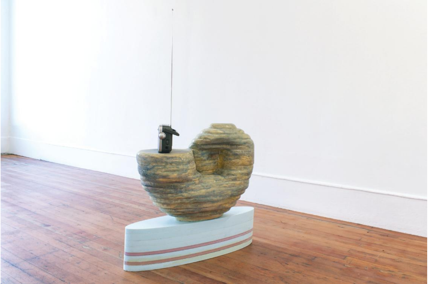
Gabi Dao, Curled Up in a Spiral , 2017