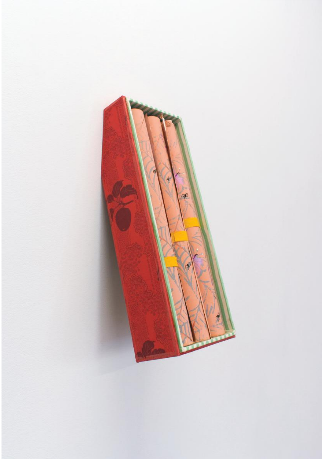
Anne Low , Paper eater , 2019, wallpaper made in collaboration with Sylvain Saily (printed by Handtrycka Tapeter, Stockholm), tissue paper, rice paper, paint, crepe paper, handwoven silk, plywood, 47.7 x 15.2 x 17.8cm