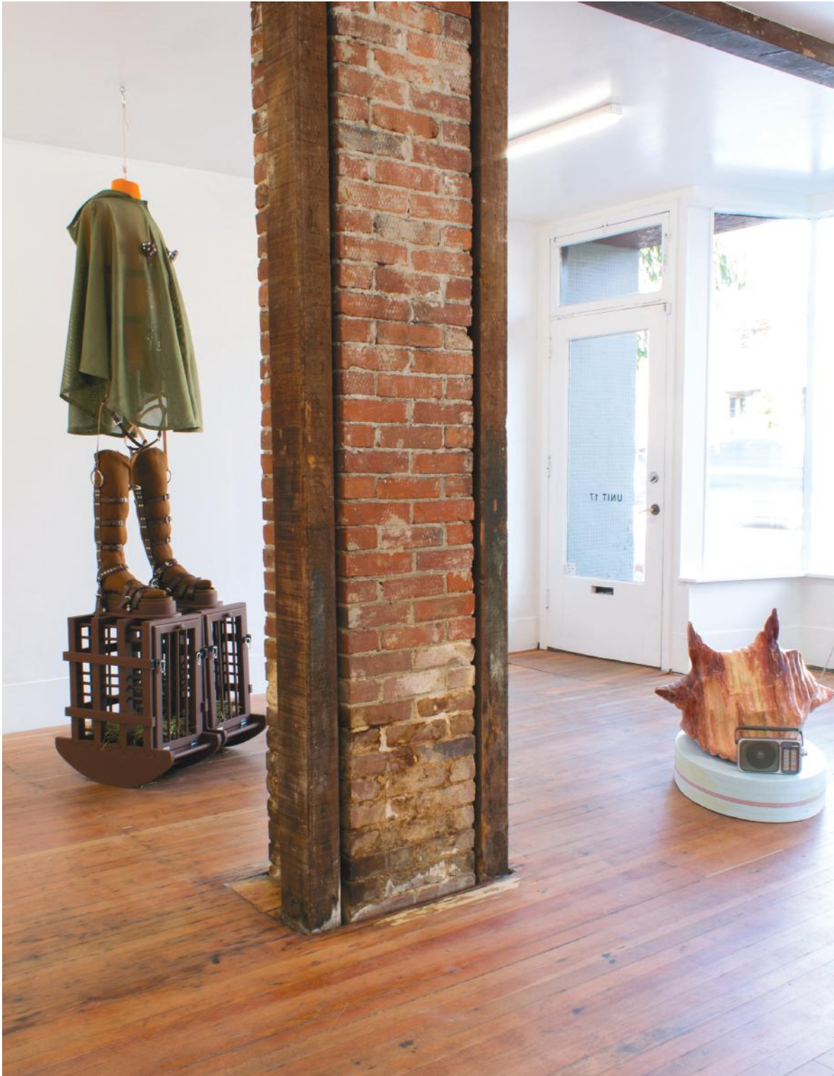
Crocodile Tears installation view