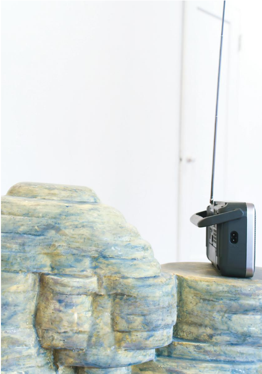
Gabi Dao, Curled Up in a Spiral , 2017 (detail)