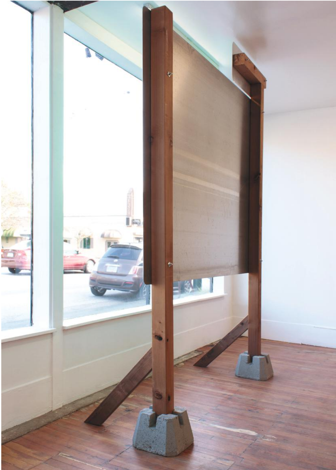
Babak Golkar, Made in Canada , 2018 aluminum, cedar, concrete, dimensions variable