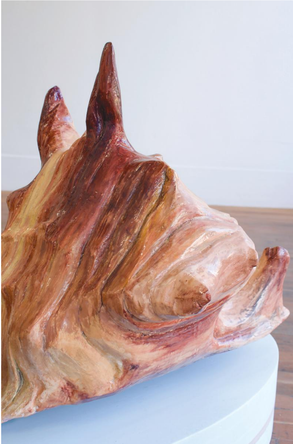
Gabi Dao , Polished Like a Shell , 2017 (detail)