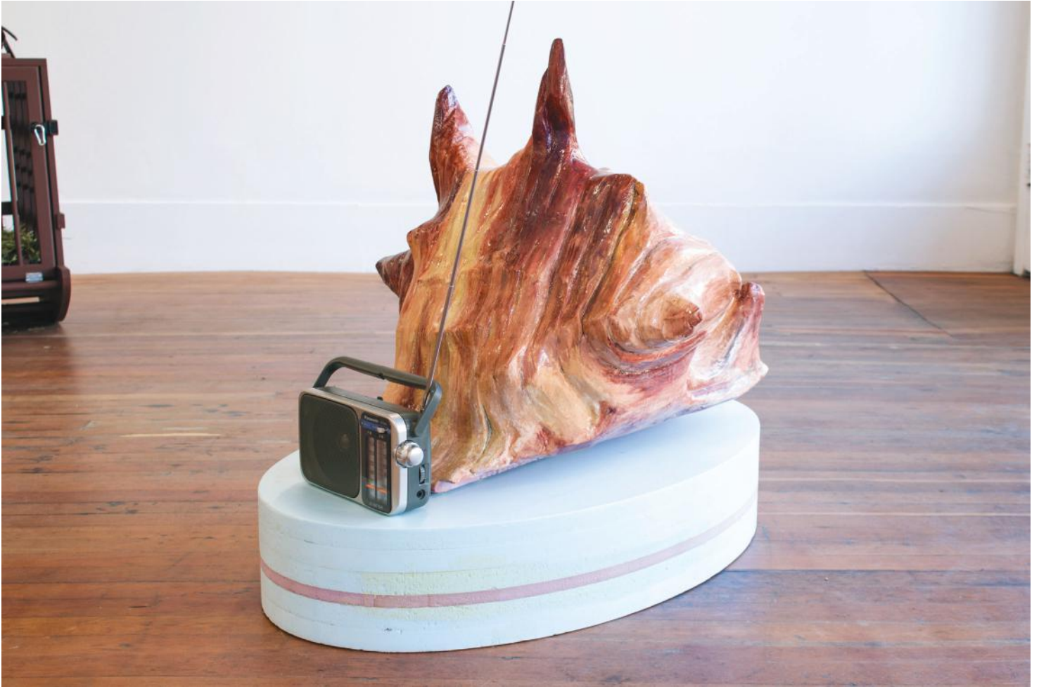
Gabi Dao, Polished Like a Shell , 2017 (detail)