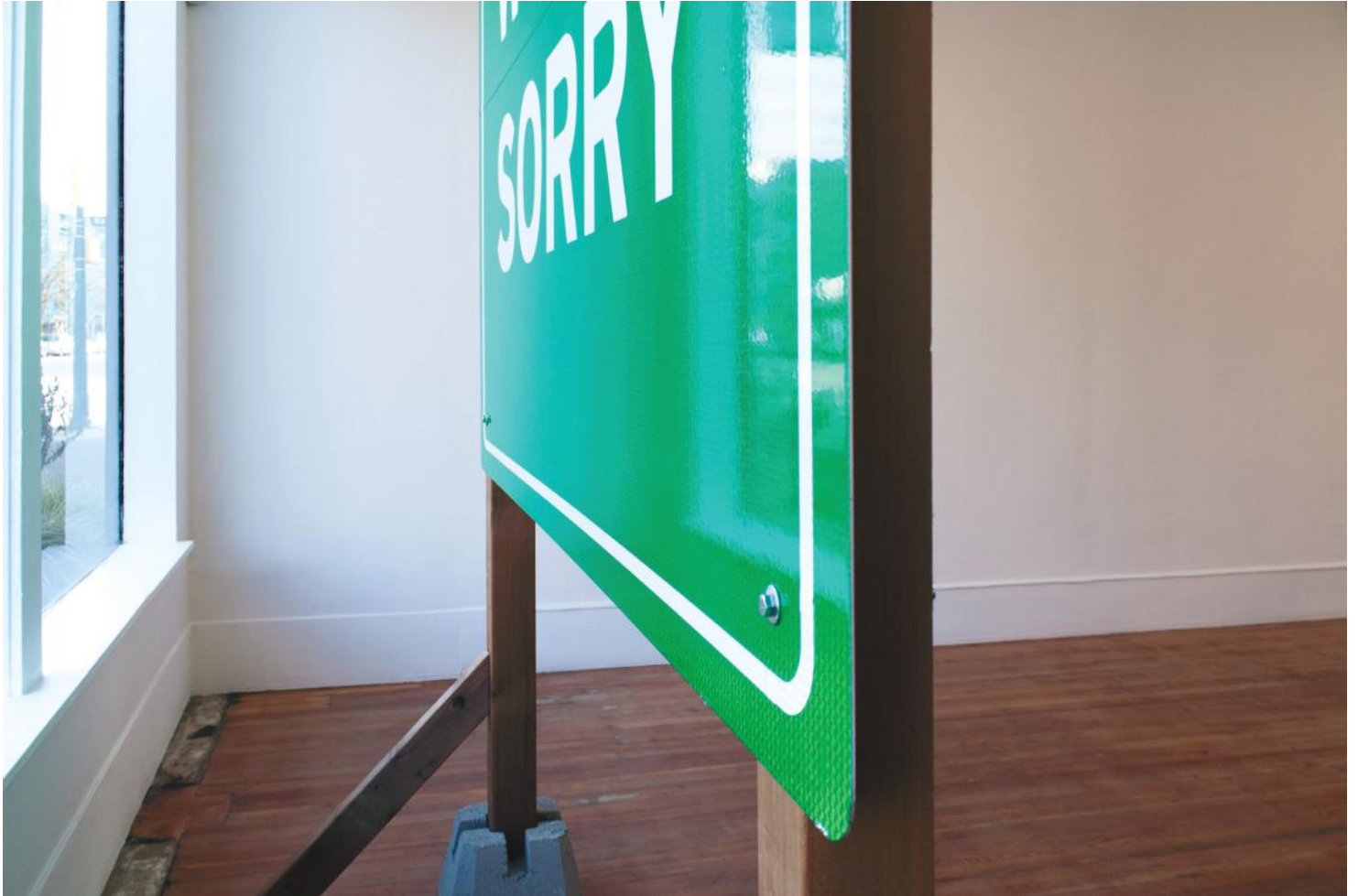
Babak Golkar, Made in Canada , 2018 (detail) aluminum, cedar, concrete, dimensions variable