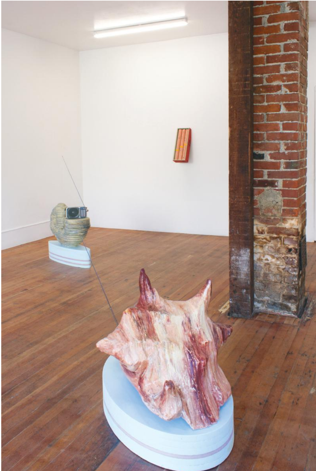
Crocodile Tears installation view