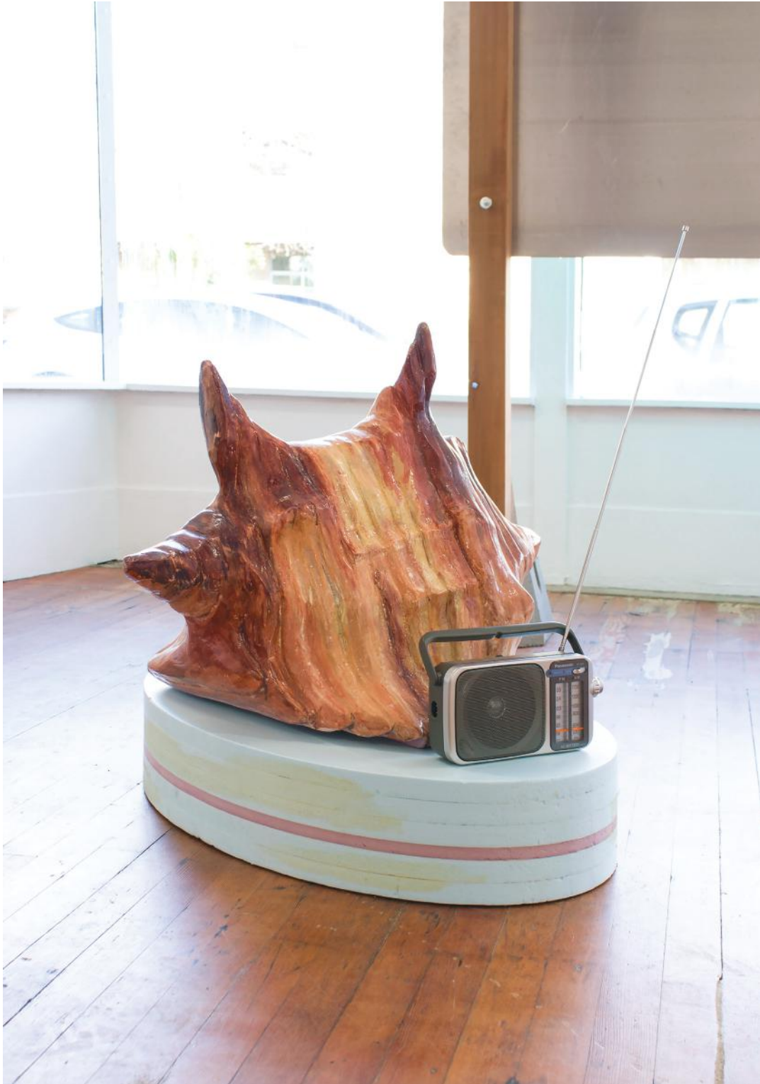
Gabi Dao , Polished Like a Shell , 2017, polystyrene, resin, radio, wood filler, audio, soap and eyeshadow pigment, dimensions variable, with Voices Tuned , 2017-20, sound, 5m35s