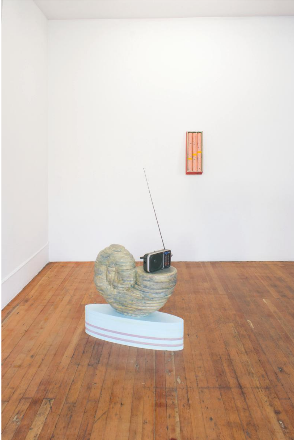
Crocodile Tears installation view