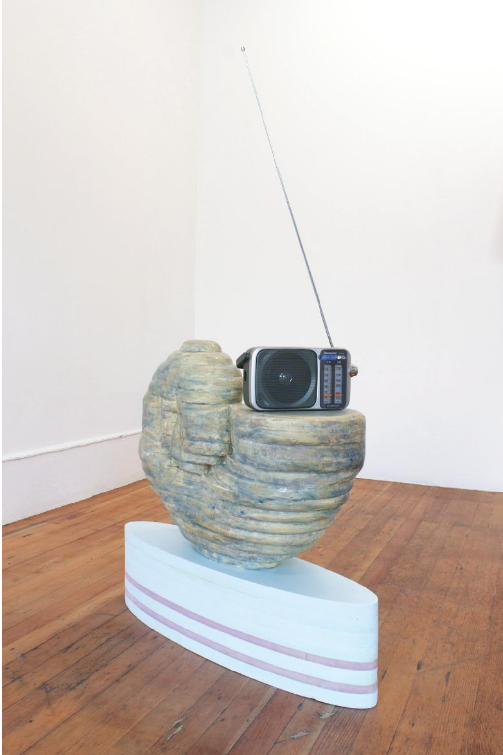
Gabi Dao , Curled Up in a Spiral , 2017, polystyrene, resin, wood filler, radio, audio, soap and eyeshadow pigment, dimensions variable, with Voices Tuned , 2017-20, sound, 5m35s