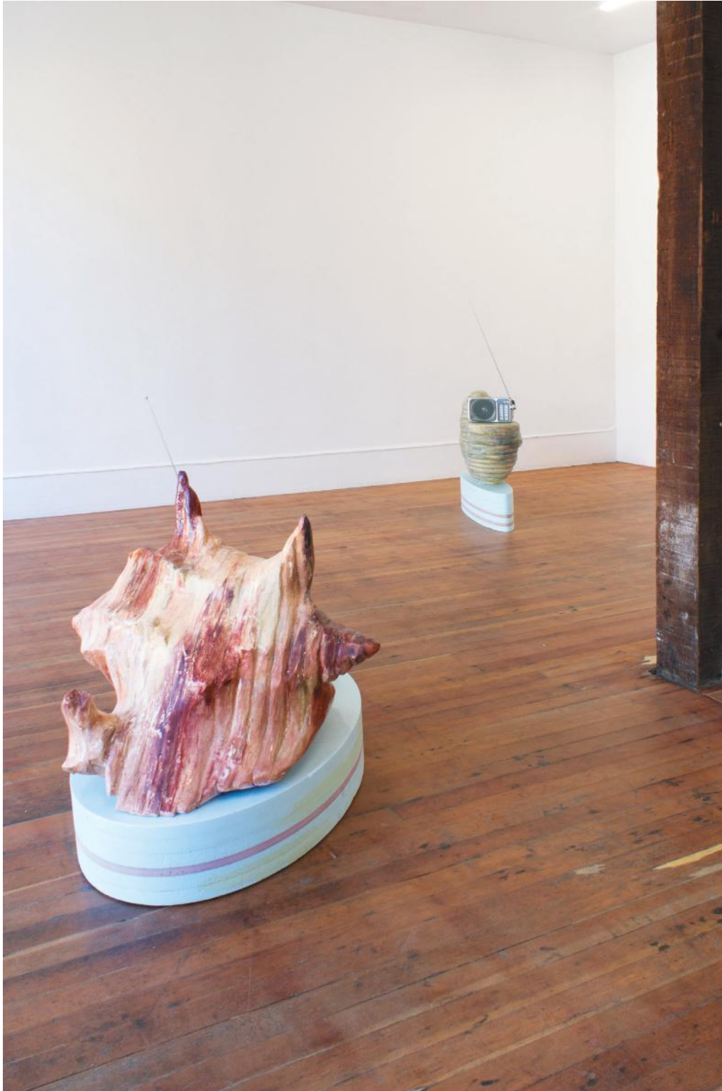
Crocodile Tears installation view