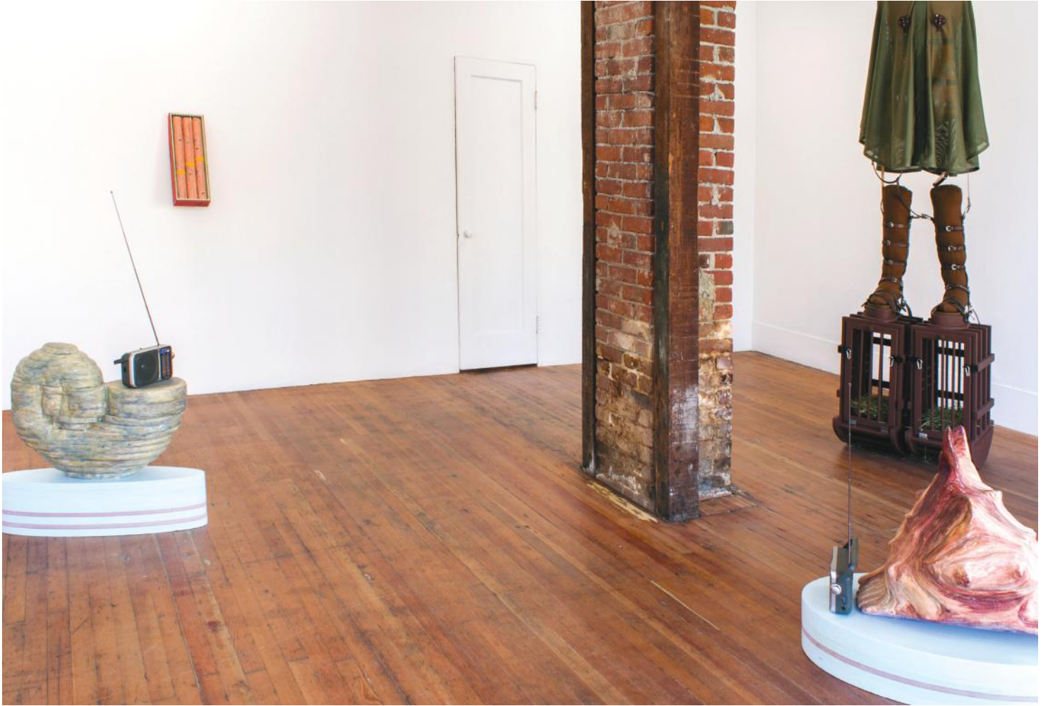
Crocodile Tears installation view