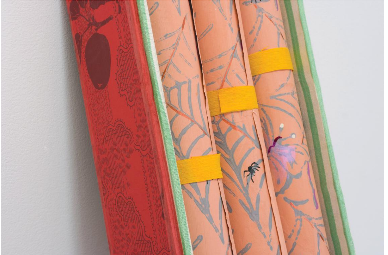
Anne Low, Paper eater , 2019 (detail)