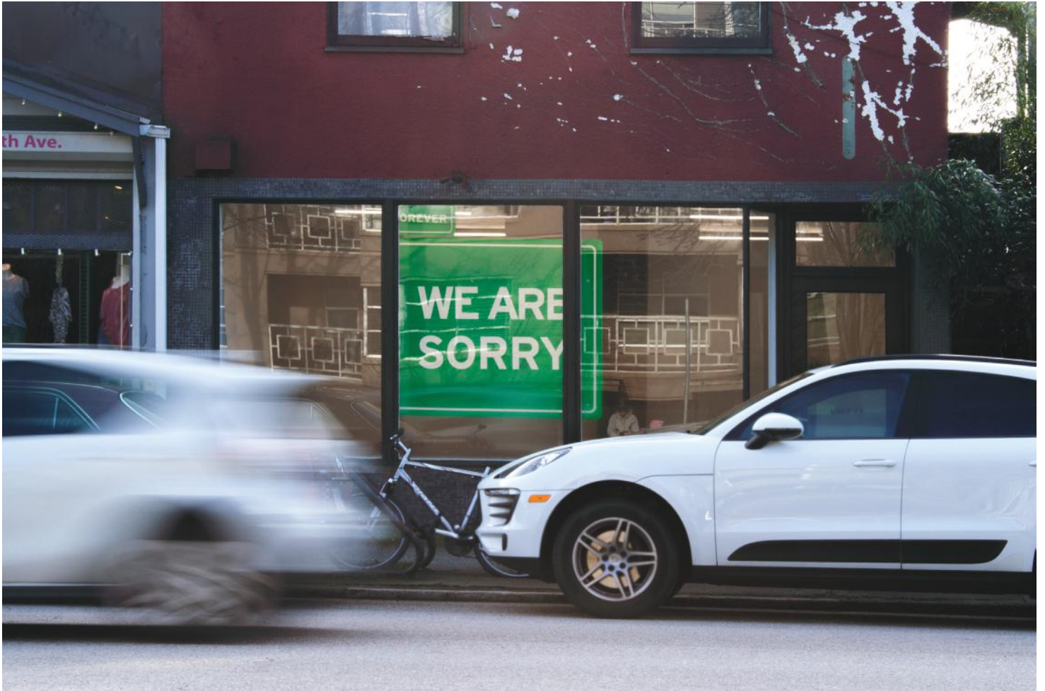
Crocodile Tears installation view with Babak Golkar, Made in Canada , 2018, aluminum, cedar, concrete, dimensions variable