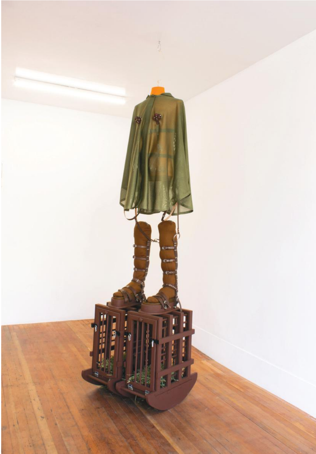
Mike Bourscheid, Frantz H.B. , 2020, wood, leather, metal hardware, urethane rubber, fabric, poly-fil, hay, eggs, chicken feathers, frying pan, cutlery, metal skewers, poultry carving set in leather case, bulb of garlic, parsley, dimensions variable