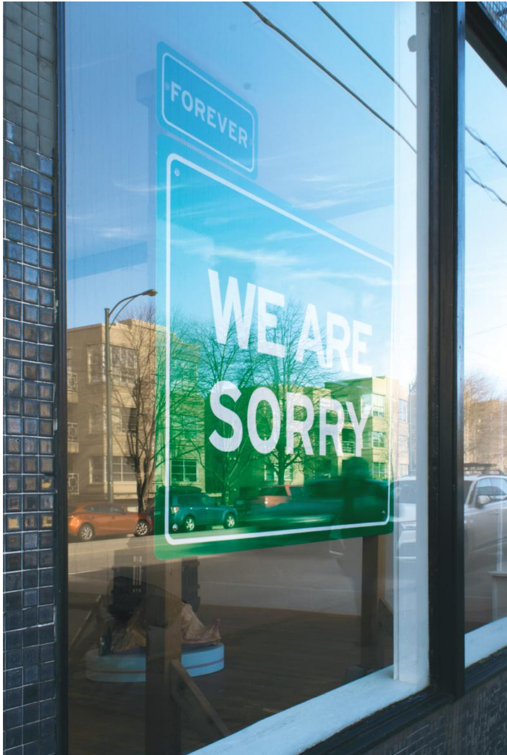
Babak Golkar, Made in Canada , 2018 (detail) aluminum, cedar, concrete, dimensions variable