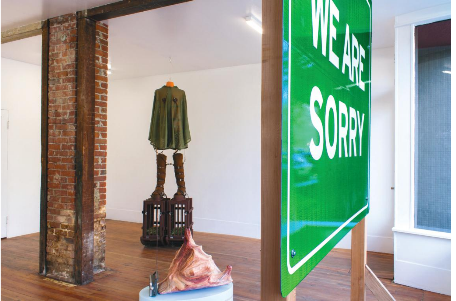
Crocodile Tears installation view