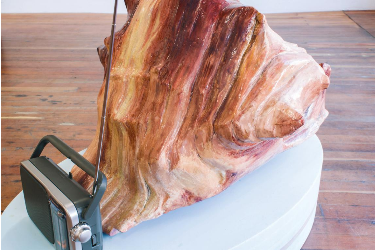
Gabi Dao , Polished Like a Shell , 2017 (detail)