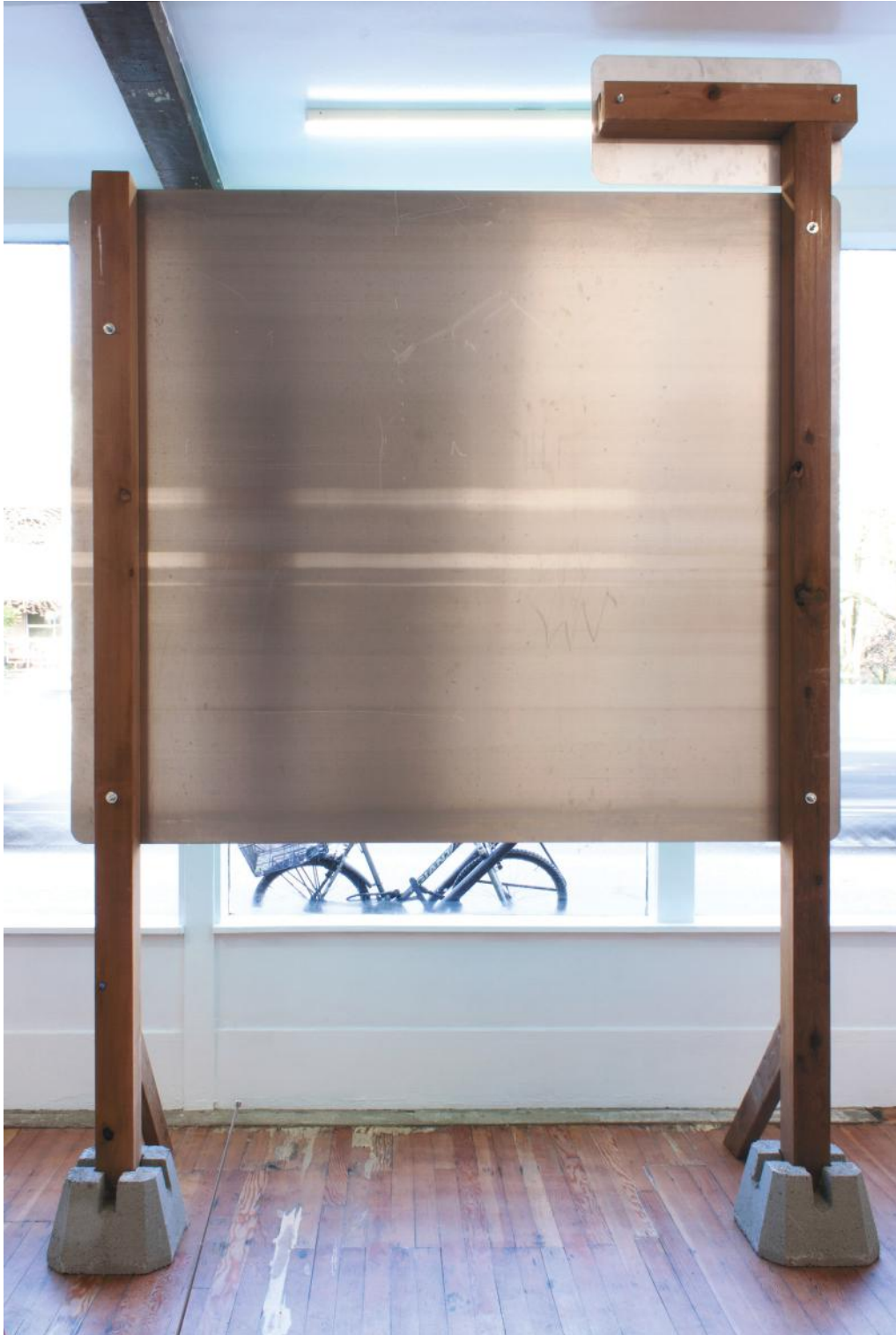
Babak Golkar, Made in Canada , 2018 aluminum, cedar, concrete, dimensions variable