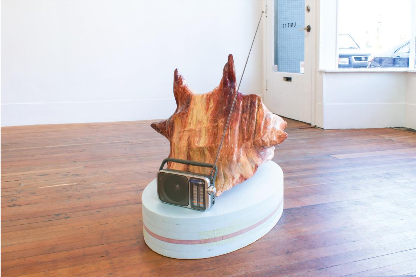
Gabi Dao , Polished Like a Shell , 2017