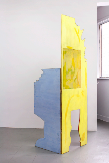
Purple Poses Plan d'Eau , 2015/2016 pigment, gouache, sand, wood, brass unique - approx. 48 x 20" & 78 X 24"