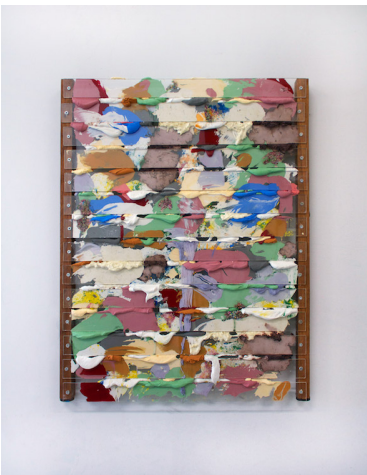
Plexi Lath , 2016

plaster, pigment, sugar, plexi, walnut wood