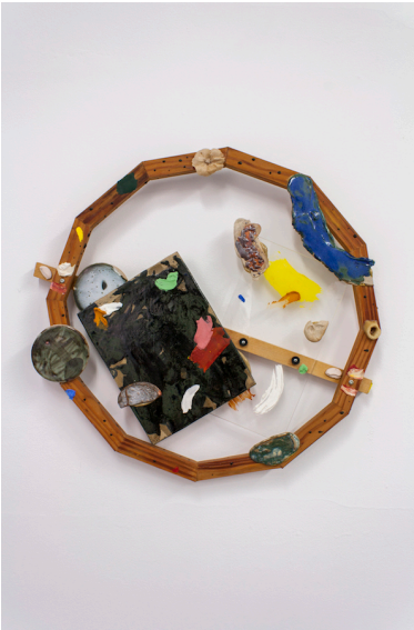
soup from stone , 2015/16

ceramic, salt ash, glue, beeswax, camellia, lamb leg bone, acrylic, plaster, pigment, walnut wood