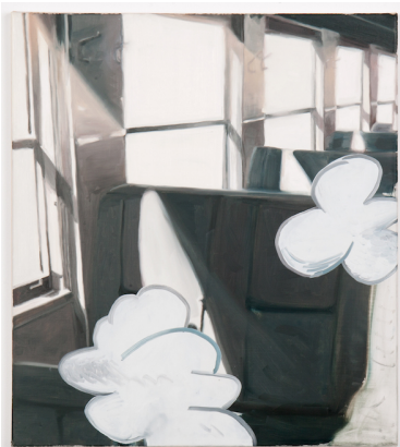
The Innovator , 2015 oil on canvas unique - approx. 20 x 18"