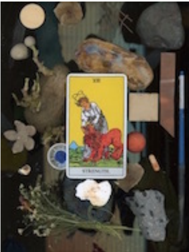
Scan 592 (Strength) , 2016 archival print on 100% cotton rag paper on artist's frame unique - approx. 28 x 20"