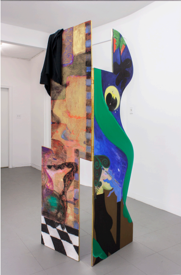
Purple Poses Weird Sisters , 2015/2016 gouache, oil, sand, potato stamp, wood, brass unique - approx. 75 x 20" & 75 x 23"