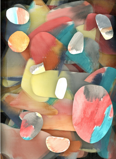
Scan 071 , 2011/2016 archival print on 100% cotton rag paper on artist's frame unique - approx. 38 x 28"