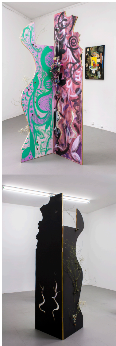
Purple Poses , 2015/2016 pigment, gouache, copper pipe, wood, brass unique - approx. 78 x 22" & 73 x 21"